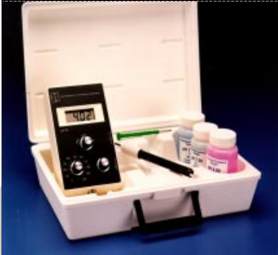
pH Model 59